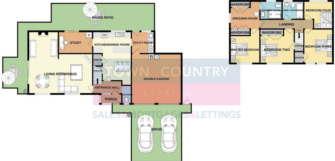
1ST FLOOR 747 sq.ft. (69.4 sq.m.) approx.

TOTAL FLOOR AREA : 1877 sq.ft. (174.4 sq.m.) approx.